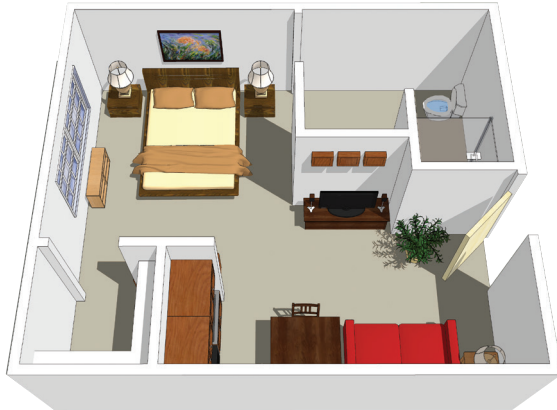
One Bedroom 378-504 sf