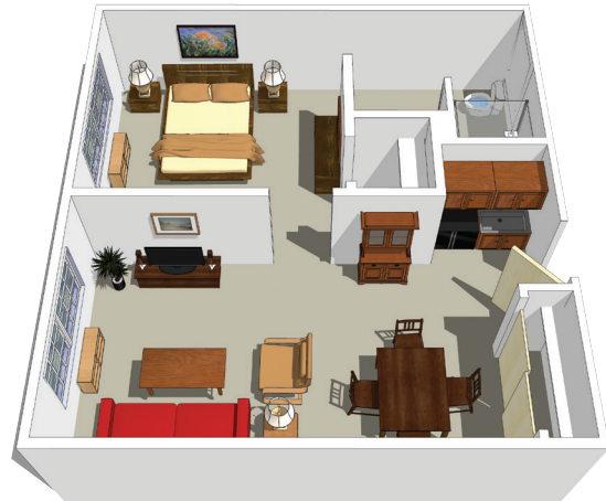
One Bedroom Deluxe 552 sf